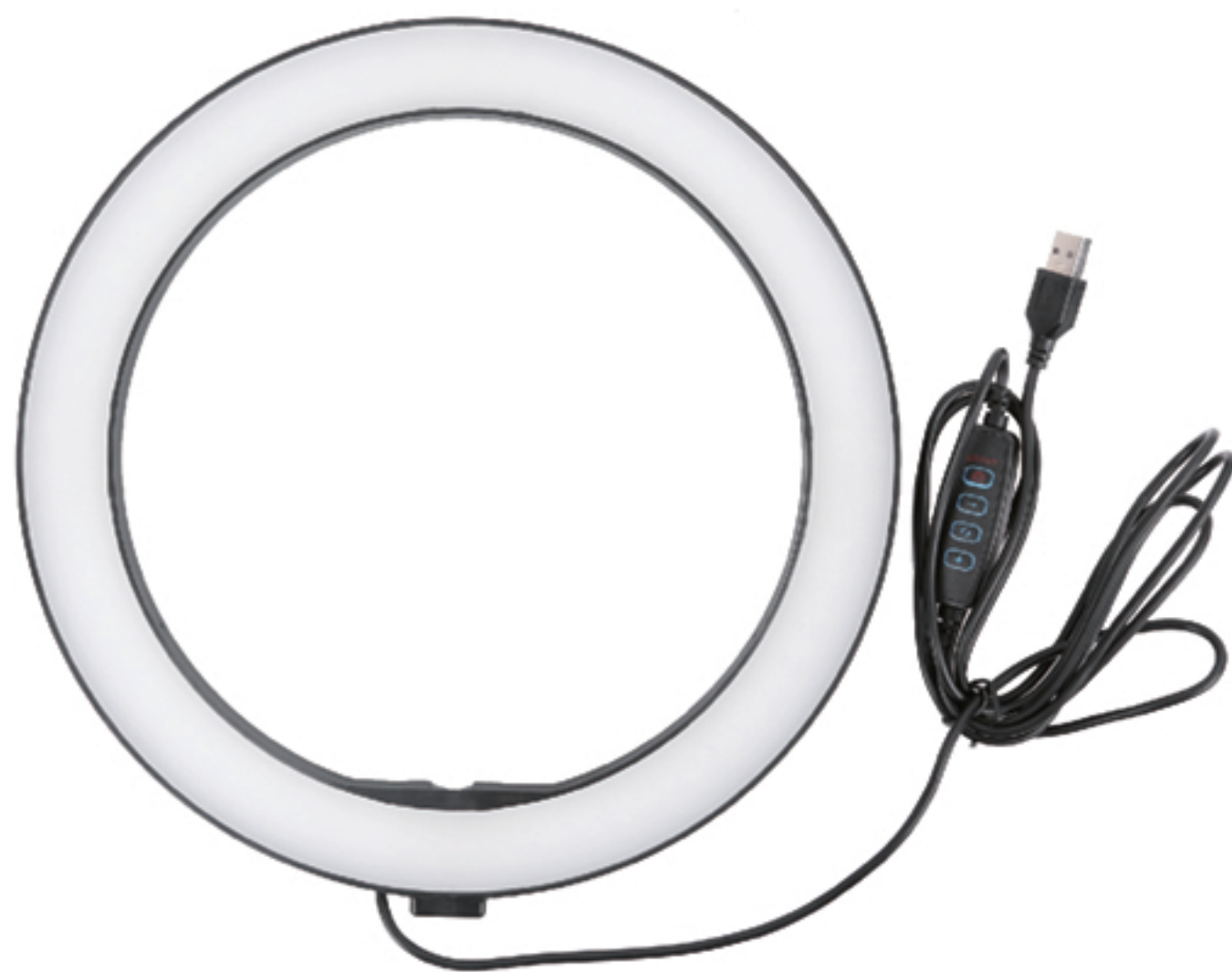
① Ring light