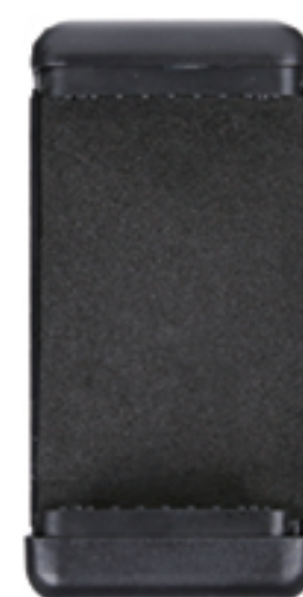
⑤ Mobile phone clip