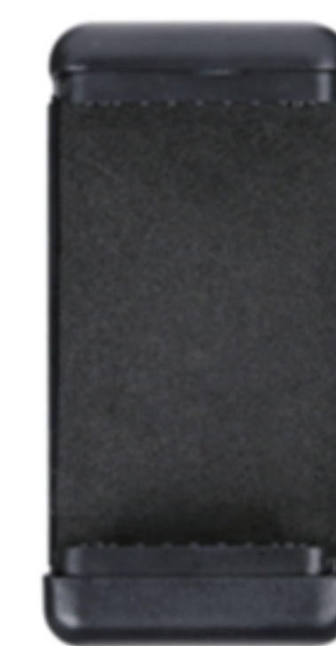
⑤ Mobile clip