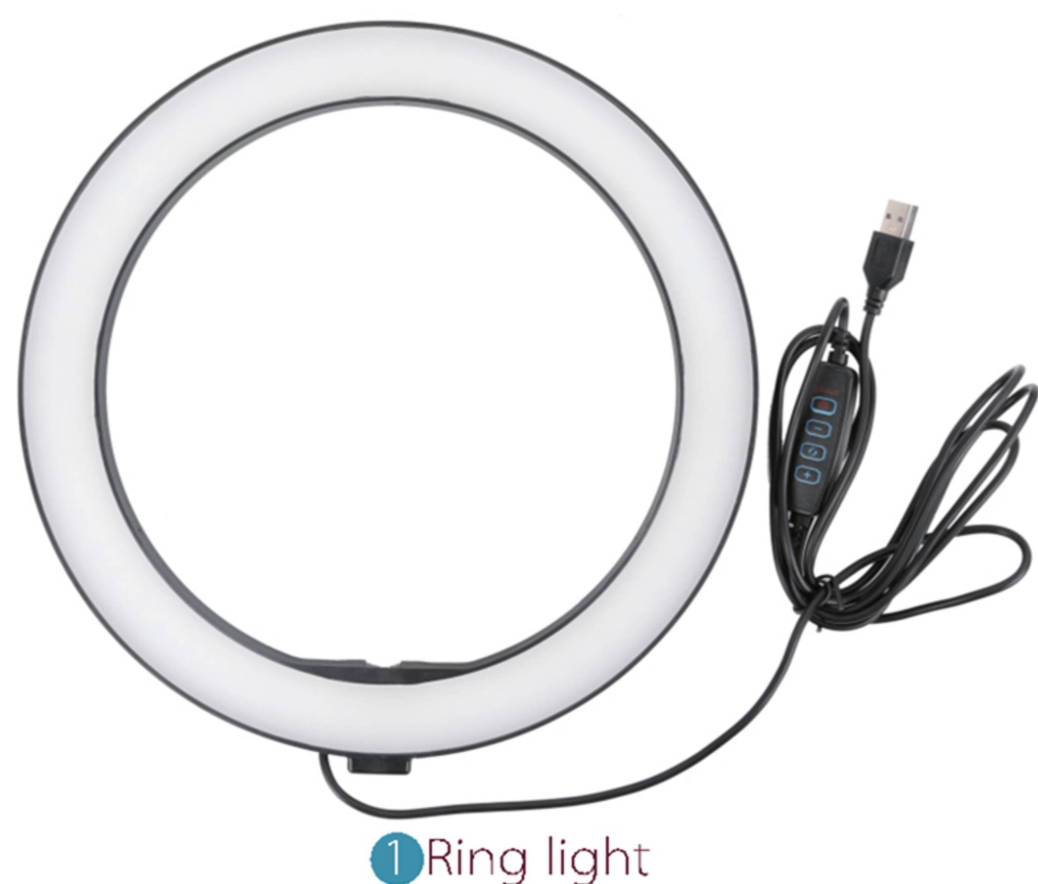
① Ring light